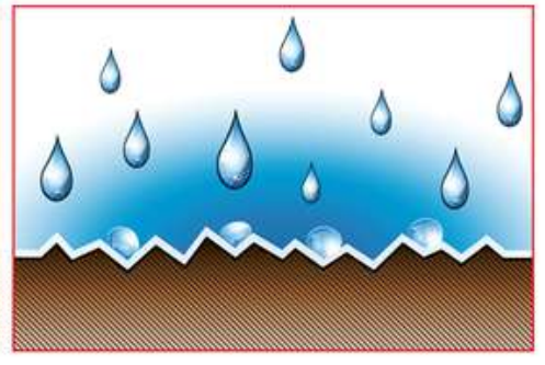
1. Uncoated surface material allows water to absorb in.